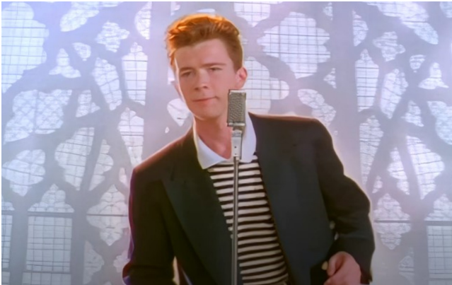
Figure 1: You Looked

We're no strangers to love You know the rules and so do I (do I), A full commitment's what I'm thinking of You wouldn't get this from any other guy I just wanna tell you how I'm feeling Gotta make you understand Never gonna give you up Never gonna let you down Never gonna run around and desert you Never gonna make you cry Never gonna say goodbye Never gonna tell a lie and hurt you We've known each other for so long Your heart's been aching, but you're too shy to say it (say it) Inside, we both know what's been going on (going on) We know the game and we're gonna play it And if you ask me how I'm feeling Don't tell me you're too blind to see Never gonna give you up Never gonna let you down Never gonna run around and desert you Never gonna make you cry Never gonna say goodbye Never gonna tell a lie and hurt you Never gonna give you up Never gonna let you