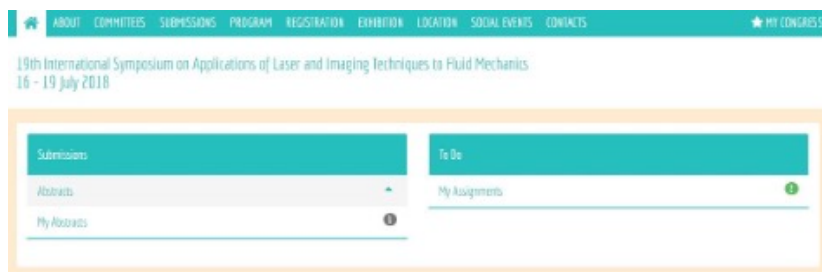
Figure 2. Step 1. Access the “My Assignments” area, which opens after acceptance.

Upload the abstract up to June 1st, 2024 at the site through your account following 2 simple steps.