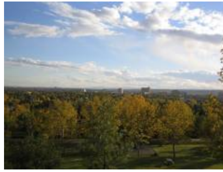
(b) Pan ma signo.