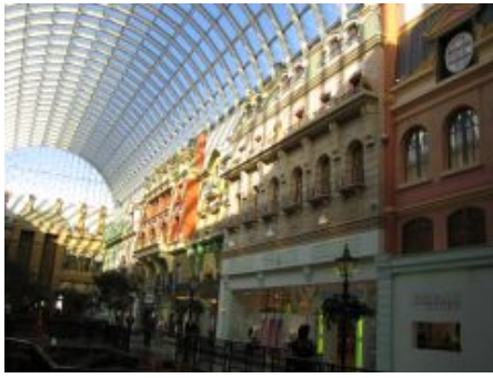
(a) Asia personas duo.