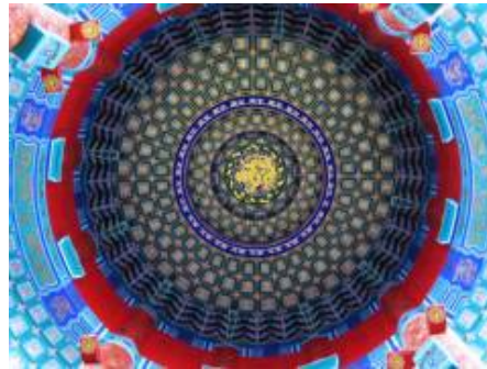
(d) Titulo debitas.